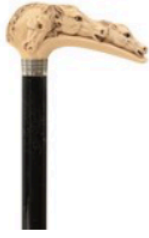
AN EARLY 20TH CENTURY WALKING CANE, the ivory handle carved as three horse's heads, above white Lot 481

Date: 26 Mar Estimate: 180 - 220 GBP Opening price: 110 GBP Additional Fees ?