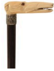
A LATE 19TH/EARLY 20TH CENTURY WALKING CANE, the ivory handle carved as a greyhound with glass Lot 483

Date: 26 Mar Estimate: 120 - 180 GBP Opening price: 70 GBP Additional Fees ?