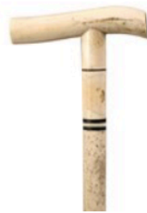
AN EARLY 20TH CENTURY MARINE IVORY WALKING CANE, the handle of plain form, above narrow ebonised