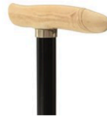
AN EARLY 20TH CENTURY EROTIC WALKING CANE, the ivory handle carved as a penis, ebonised haft, metal tip Lot 495

Date: 26 Mar Estimate: 200 - 300 GBP Opening price: 70 GBP Additional Fees ?