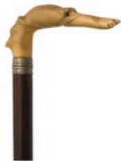
AN EARLY 20TH CENTURY WALKING CANE, the horn handle carved as the head of a greyhound, tapering