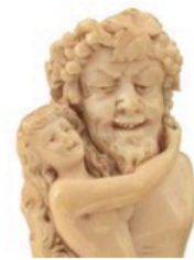
A LATE 19TH/EARLY 20TH CENTURY WALKING CANE, the ivory handle finely carved as a naked female Lot 477

Date: 26 Mar Estimate: 250 - 350 GBP Opening price: 90 GBP Additional Fees ?