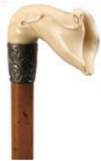
A LATE 19TH CENTURY WALKING CANE, the ivory handle carved as an orchid bloom, above silver collar