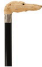
A LATE 19TH CENTURY WALKING CANE, the ivory handle carved as a greyhound with glass Lot 486

Date: 26 Mar Estimate: 180 - 220 GBP Opening price: 110 GBP Additional Fees ?