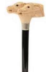
AN EARLY 20TH CENTURY WALKING CANE, the ivory handle carved as two bridled racing horses' heads with Lot 489

Date: 26 Mar Estimate: 180 - 220 GBP Opening price: 110 GBP Additional Fees ?