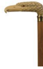
AN EARLY 20TH CENTURY WALKING CANE, the large ivory handle carved as the head of an eagle with glass