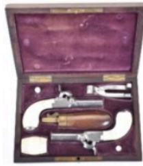
^ Pair of good quality Belgian boxlock percussion pocket pistols c.1830 Lot 212

Date: 22 Jan Location: Royal Tunbridge Wells, Kent Estimate: 2,500 - 5,000 GBP Additional Fees ?