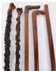
5x assorted wooden walking sticks c.1900 Lot 206

Date: 22 Jan Location: Royal Tunbridge Wells, Kent Estimate: 100 - 200 GBP Additional Fees ?