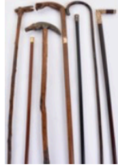
Fine late 19th century gentleman's slender hardwood walking cane Lot 200

Date: 22 Jan Location: Royal Tunbridge Wells, Kent Estimate: 100 - 200 GBP Additional Fees ?