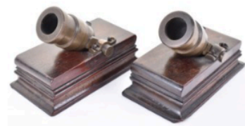
Pair of model Cohorn mortars c.1850 Lot 213

Date: 22 Jan Location: Royal Tunbridge Wells, Kent Estimate: 200 - 400 GBP Additional Fees ?