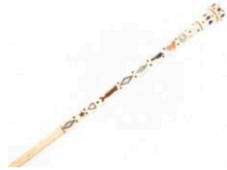
^ Fine whalebone walking stick, 19th century Lot 165

Date: 22 Jan Location: Royal Tunbridge Wells, Kent Estimate: 600 - 1,000 GBP Additional Fees ?