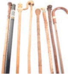
8x assorted walking sticks Lot 199

Date: 22 Jan Location: Royal Tunbridge Wells, Kent Estimate: 100 - 200 GBP Additional Fees ?