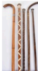
3x assorted walking sticks each with a silver top Lot 203

Date: 22 Jan Location: Royal Tunbridge Wells, Kent Estimate: 100 - 200 GBP Additional Fees ?