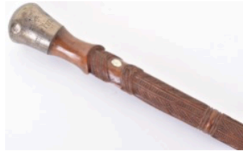
Maori carved wooden walking stick Lot 188

Date: 22 Jan Location: Royal Tunbridge Wells, Kent Estimate: 150 - 250 GBP Additional Fees