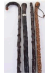
4x assorted knobly walking sticks Lot 201

Date: 22 Jan Location: Royal Tunbridge Wells, Kent Estimate: 100 - 200 GBP Additional Fees ?