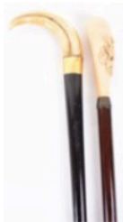
^ Walking stick c.1900 Lot 175

Date: 22 Jan Location: Royal Tunbridge Wells, Kent Estimate: 100 - 200 GBP Additional Fees ?